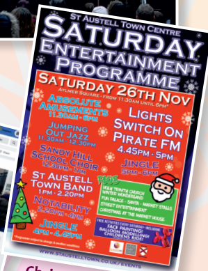
Christmas Event Posters